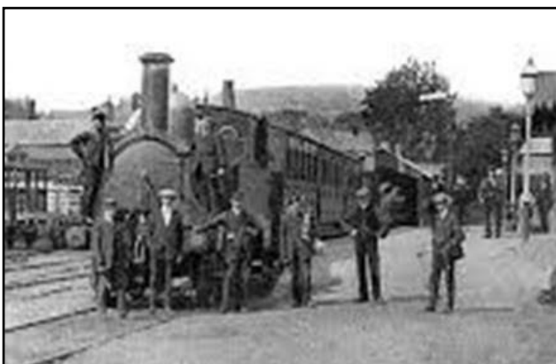
Above: Bishop's Castle Station in Victorian Times. The Weighbridge site will be open on 19 th September.

In September, Bishop's Castle will have a farmers' market on the 19 th September and the Bishop's Castle Railway Weighbridge site will also be open as part of National Heritage Day, this will be a great opportunity to see the restoration progress that has been made.